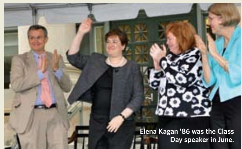
Elena Kagan '86 was the Class Day speaker in June.