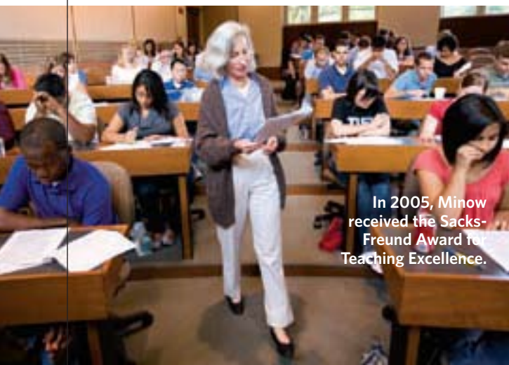
In 2005, Minow received the Sacks-Freund Award for Teaching Excellence.